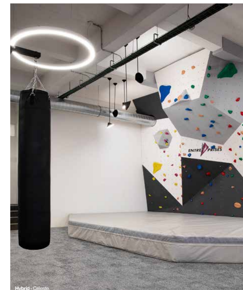
Hybrid - Celeste