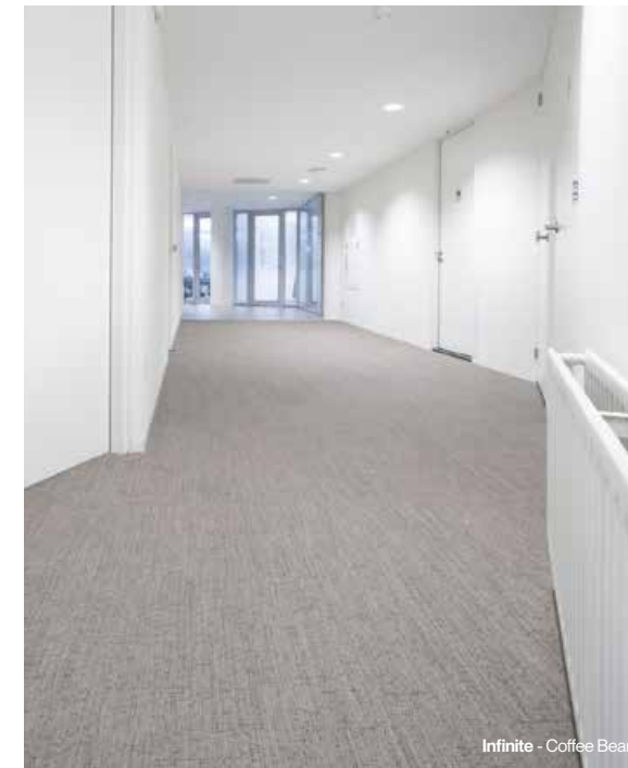
Infinite - Coffee Bean