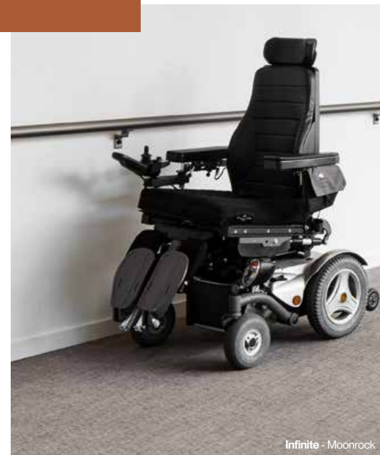
Infinite - Moonrock