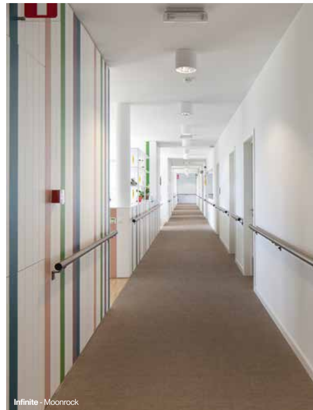
Infinite - Moonrock