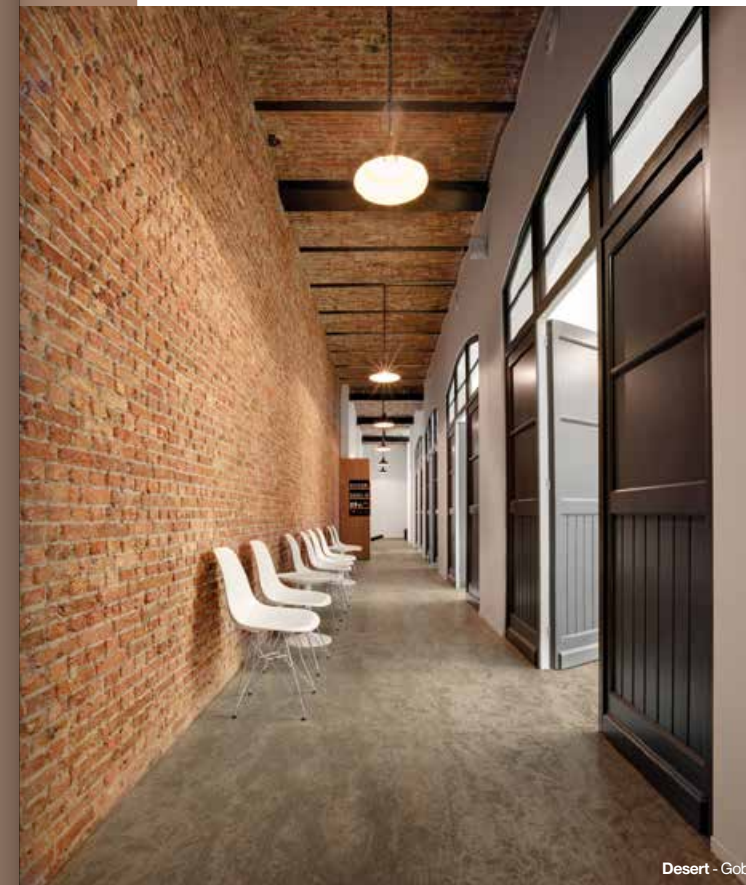
Desert - Gobi