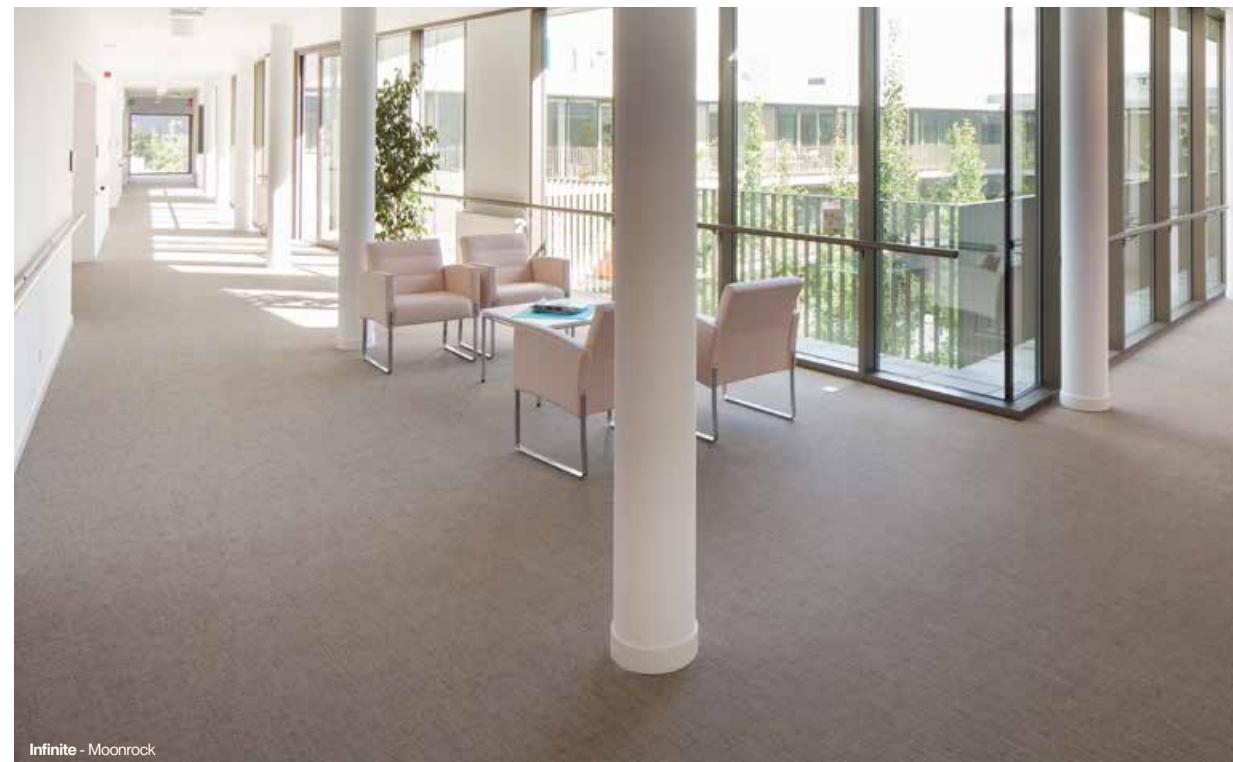
Infinite - Moonrock